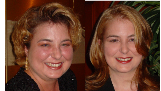
With Cushing's Normal Appearance

Cushing's Syndrome has many symptoms, including weight gain and a change in appearance.